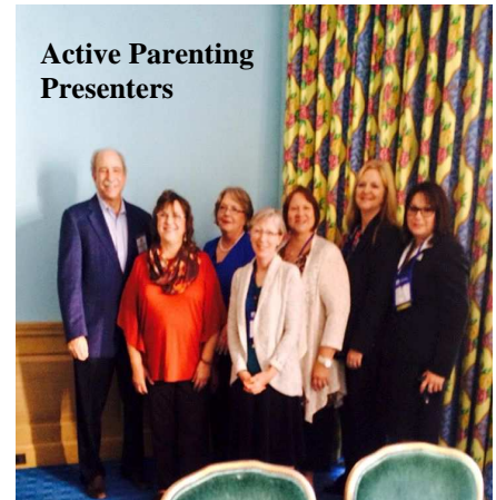
Active Parenting Presenters