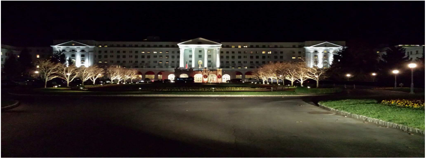
NEAFCS in Greenbriar in White Sulphur Springs, West Virginia at night