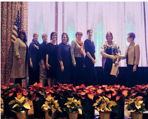
Tai Chi Winners