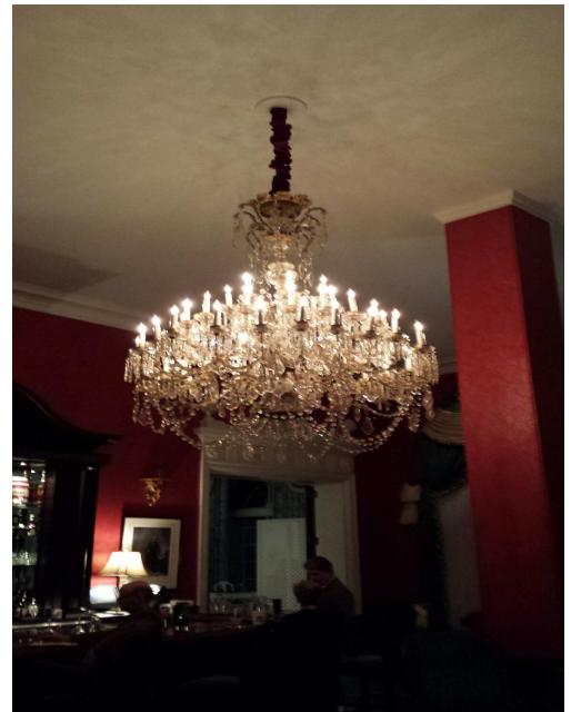
Chandelier used in the movie Gone with the Wind