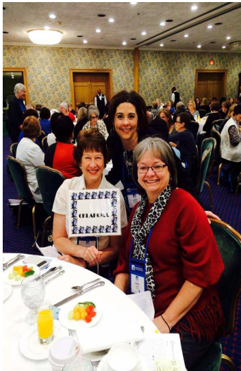
Oklahoma Voting Delegates