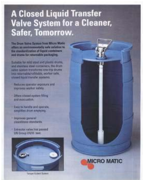
Figure 3. Micro Matic cut away showing drop tube extraction system.