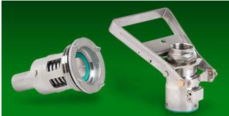
Figure 3. Micro Matic cut away showing drop tube extraction system.